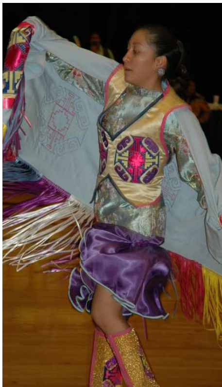
Above: Participant at the UVSC Pow Wow

Award IV: November 15 Award I: February 15