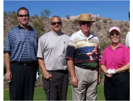
Team Eagle Roofing